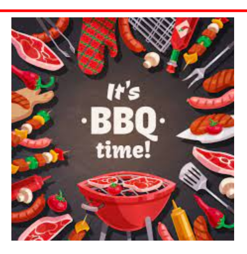
Our first BBQ of the season is this Saturday May 20, 2023.